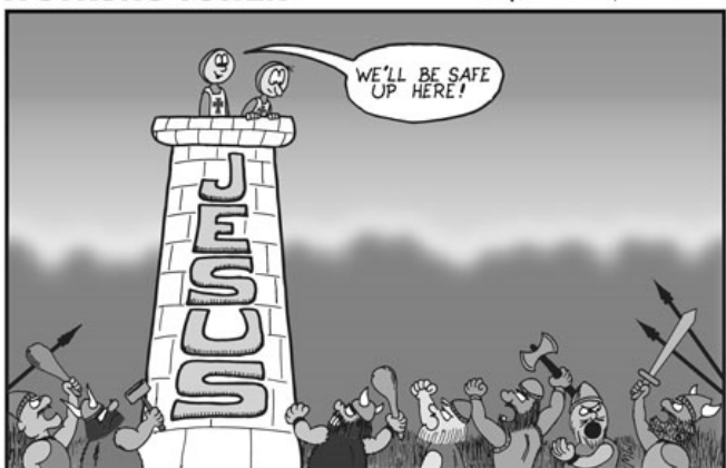
The name of the LORD is a strong tower; the righteous run to it and are safe. -PROVERBS 18:10 NIV